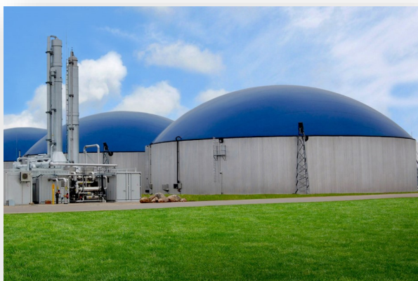
BIOGAS AND AD PLANT, INCL RENEWEABLE ENERGIES

ALLVALVES ONLINE have always sold into a variety of industries with its wide range of products covering many applications, the team often exhibit around the world and visit international shows to meet customers in the different industries served. These include but are not limited to: