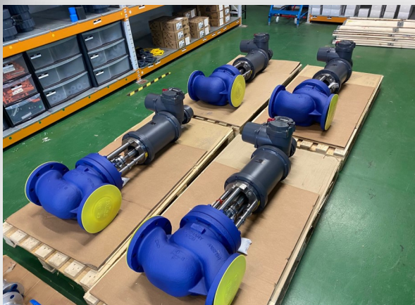
Over £100,000 UK project for ARI control valves & manual valves