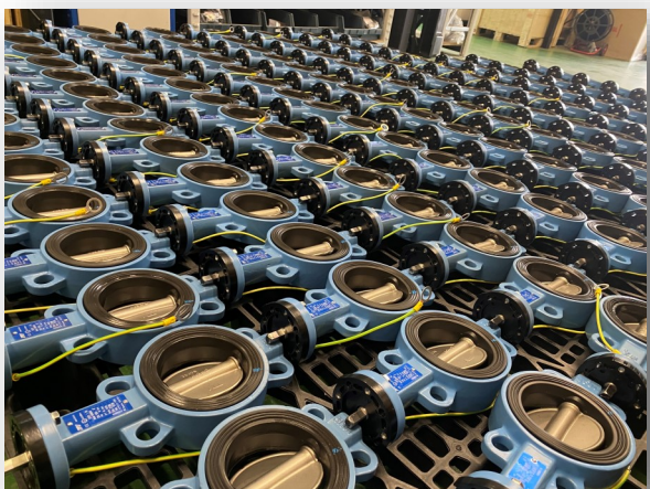
Over 800 TTV Butterfly Valves for Export to Dubai