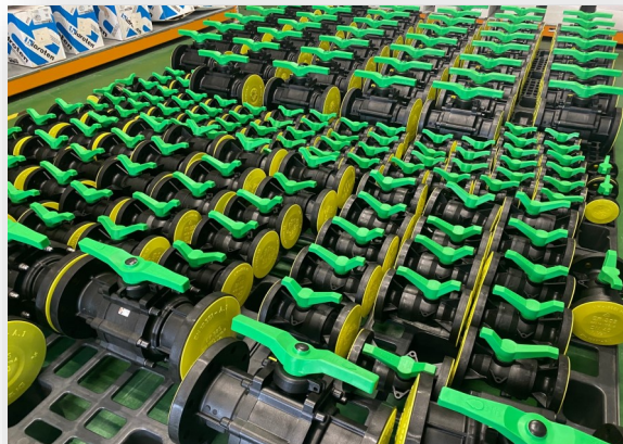
Large quantity of SAFI GRPP Flanged PN16 Ball Valves