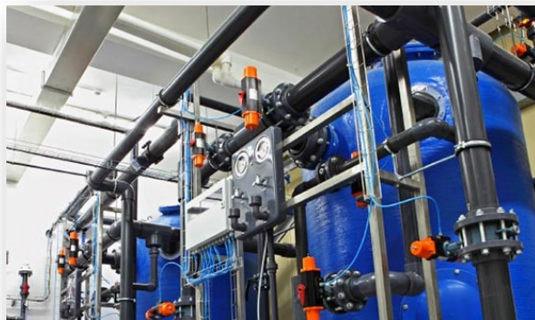
SWIMMING POOL, SPA AND AGRICULTURAL