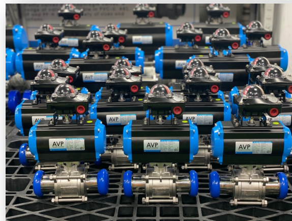
Sanitary 2 way and 3 way AVP Actuated Valve Project