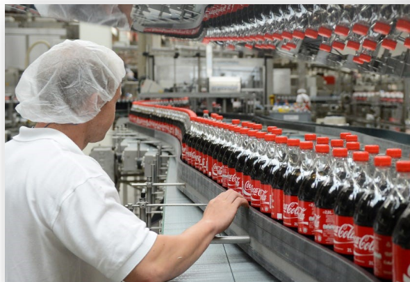
FOOD, BEVERAGE AND PHARMACEUTICAL