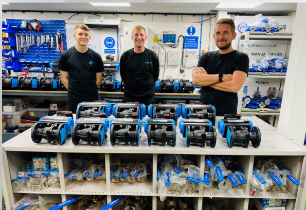
Large value AVP Actuated WCB ANSI 150 ball valve project

ALLVALVES ONLINE have sold MILLIONS of pounds worth of manual and actuated valves all around the world. Our customer base reaches every corner of the world including Europe , USA and Canada , Australia and South Africa . ALLVALVES was built on the vision of being a global company and since 2012, ALLVALVES have always worked in export and will, in the near future, open sales and stock locations around the world .