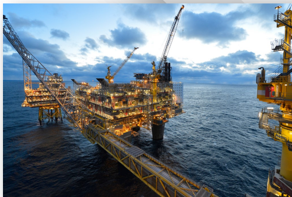
OIL AND GAS SECTORS INCLUDING OFFSHORE