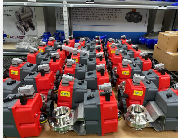
J+J Failsafe Sanitary Butterfly Valves for UK OEM

WITNESS INSPECTION AND CERTIFICATION AVAILABLE