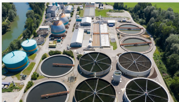
WASTE WATER TREATMENT & CHEMICAL DOSING